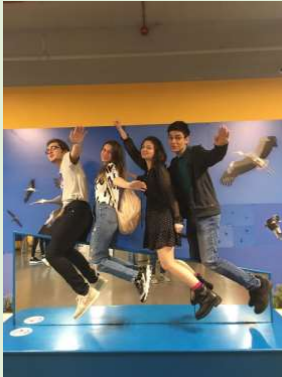
Not only were the students in the clouds, but also the teachers. ☺