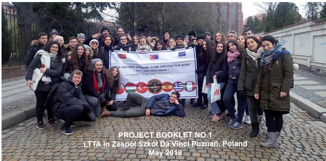
PROJECT BOOKLET NO.1 LTTA in Zespół Szkół Da Vinci Poznań, Poland May 2018